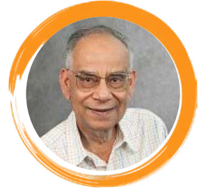
Ananda Mohan Chakrabarty